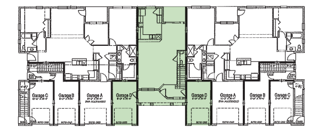
1st Floor Building Plan